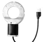
Bird Bath Defroster